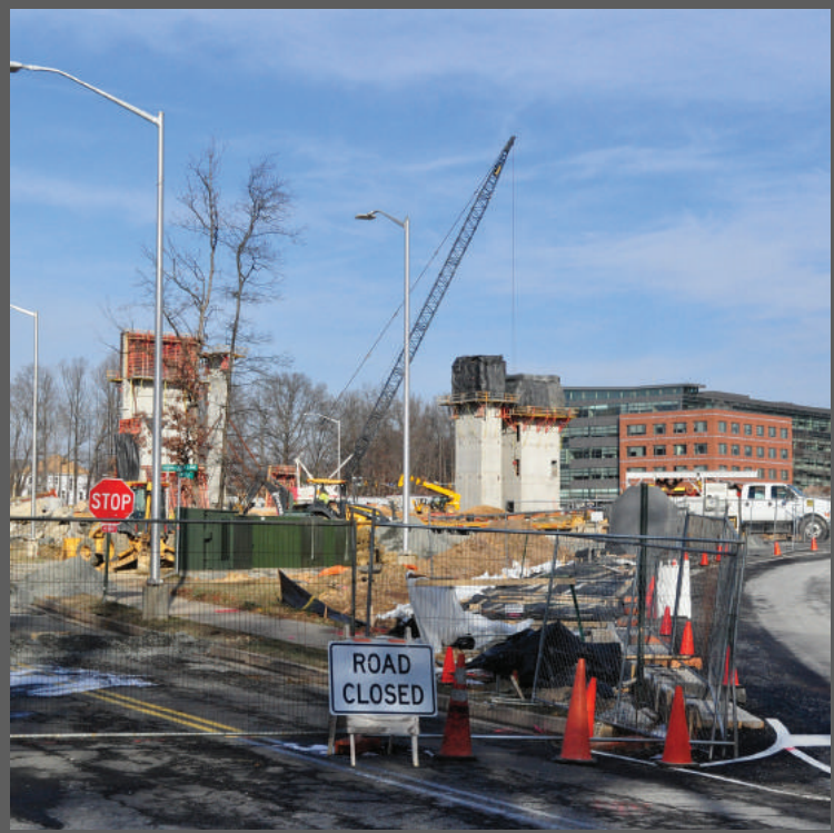
Patriot Circle will remain closed between George Mason Boulevard and Aquia Creek Lane