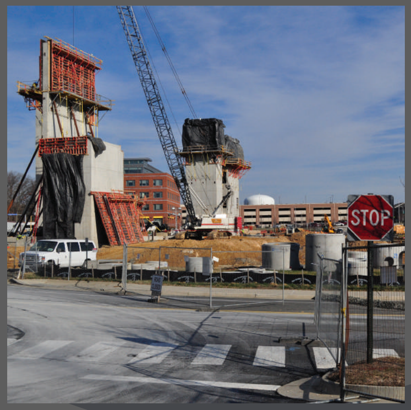
Access via Occoquan River Lane (Rogers Hall/Subway) to Patriot Circle will be closed